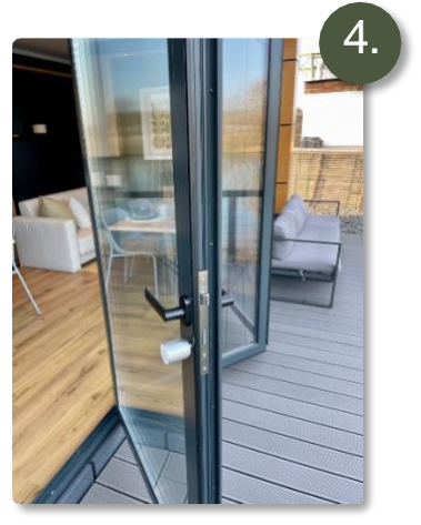
Carefully push the Window Element on the door handle