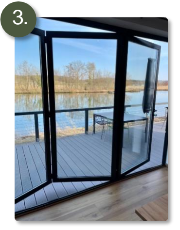
Slightly push the Window Element