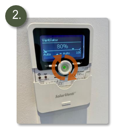
Choose desired fan speed of Select 0 – 100% on the dial \mathbf{Q}