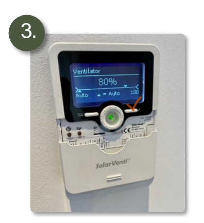
Press cofirm button twice \checkmark After about 60 minutes the previous value will be returned to