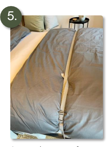
Loosen the straps of the bed linen. Ready!