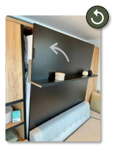
To close, go through operations 3 to 5 backwards. Then press the bed into the wall unit.