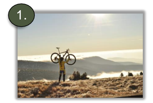
We offer bicycles and e-bikes for rent – daily flat rate.