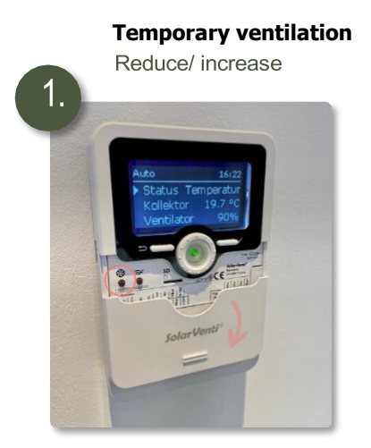
Slide the control flap down and press Ventilation icon 🛞

The solar air collector system regulates automatically and is time- and sensor-controlle. Normally, there is no need for manual regulation. If you do switch off the system, please switch into Auto mode back on latest at your departure!