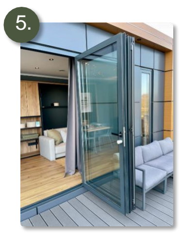
Slide open the Window Element completely