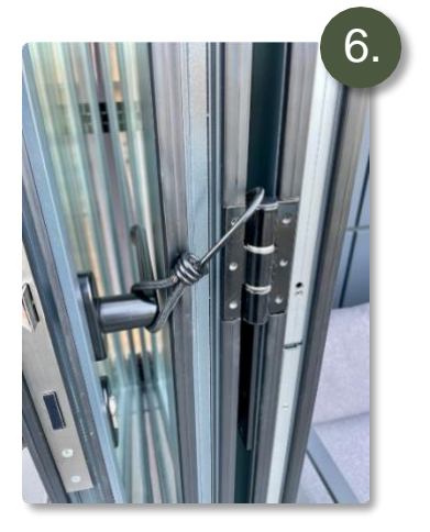
Protect against gusts of wind with expander hook (you will find it in the cutlery drawer)

To close, go backwards through operations 1 through 6, please.