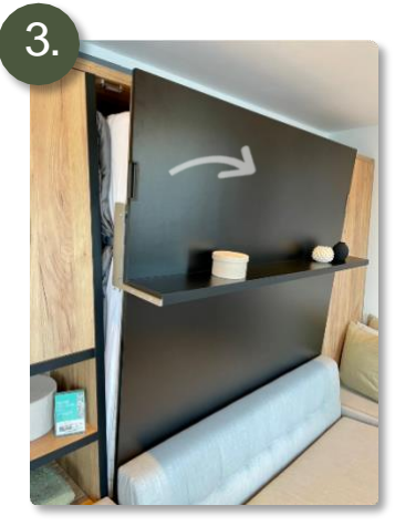
Bed stops in this position. Now pull hard until bed opens

Grasp the handle and pull the bed forward until you reach the loosen of the locking magnets.