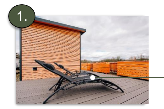
For comfort, two sun loungers are provided.